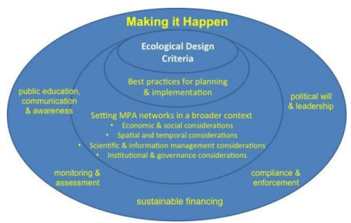
Key aspects of building MPA networks (IUCN 2008)

Dr. Tighe also presented a compilation of best practices based on work done by WCPA/IUCN and TNC that she said could further guide the countries as they develop their MPA network framework (Table 1.5.2). "The TNC list is actually a set of guidelines for learning networks, but except for the part about structure design, it actually works well for MPA networks," she pointed out.